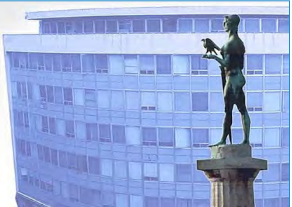
Belgrade Chamber of Commerce

Belgrade Chamber of Commerce is an interest based, independent, professional, business oriented organization, whose Members are the enterprises, the entrepreneurs and other entities that perform economic activities in Belgrade.