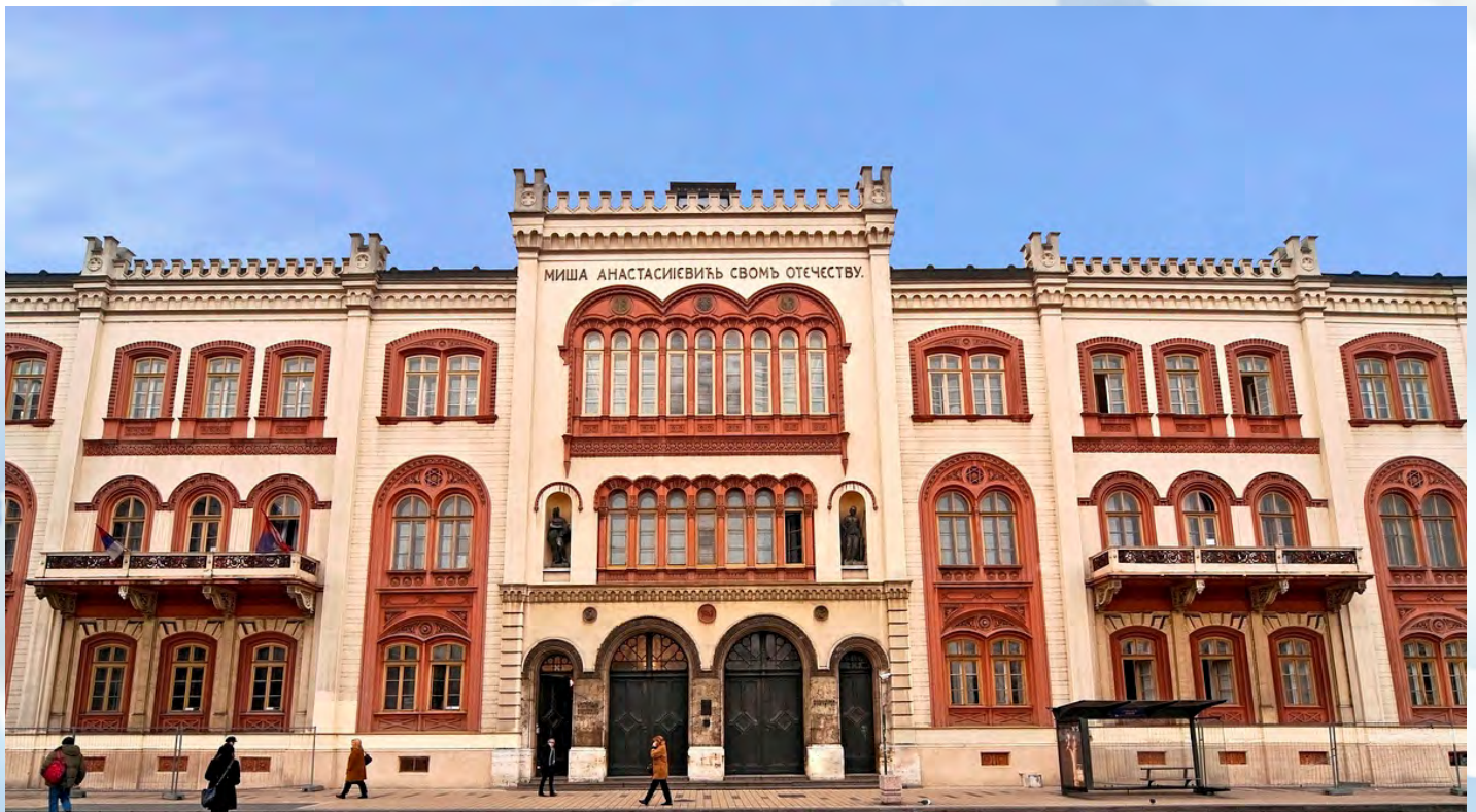
The University of Belgrade, Belgrade, Serbia