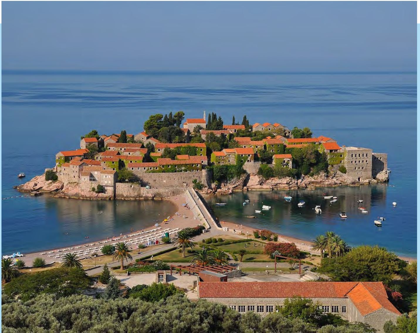
Saint Stefan, Montenegro

Serbia, Belgrade, Carigradska 28, Cetinjska 2, Tel: +381 11 322 11 18, e-mail: eu@eu.ac.rs, www.eu.ac.rs