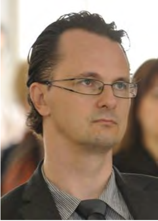
Dr. Srđan Verbić Minister of Education, Science and Tehnological Development, The Goverment of Serbia

Dr. Srđan Verbić was born on 27th of May, 1970. in Gornji Milanovac. He graduated Theoretical Physics at Faculty of Physics, University of Belgrade. After that he worked as a manager of Physics programs in Research Station Petnica. He defended his Master thesis, in the field of artificial intelligence, on the topic “Relation between minimizing of free energy, hidden Markov Chain, and decoding of linear block codes” at Faculty of Physics, in 2001.