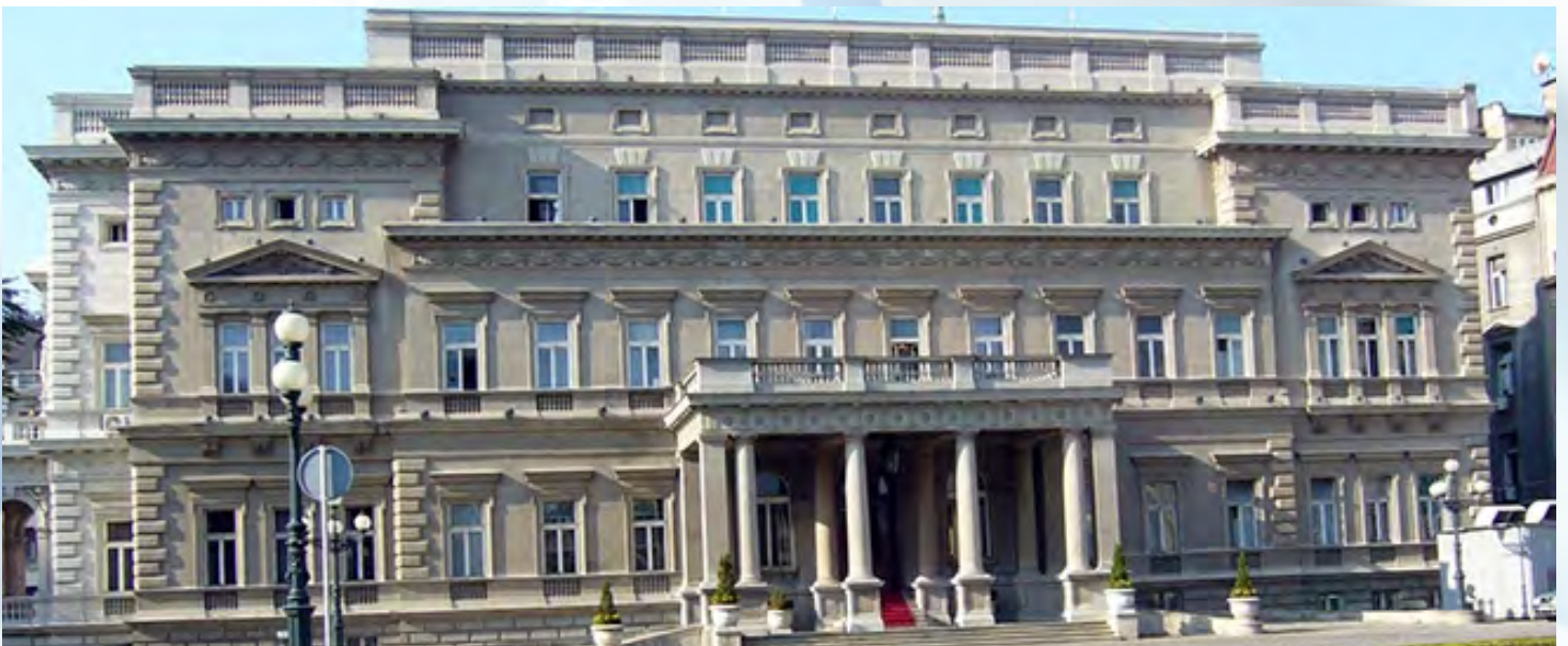
Assembly of the City of Belgrade