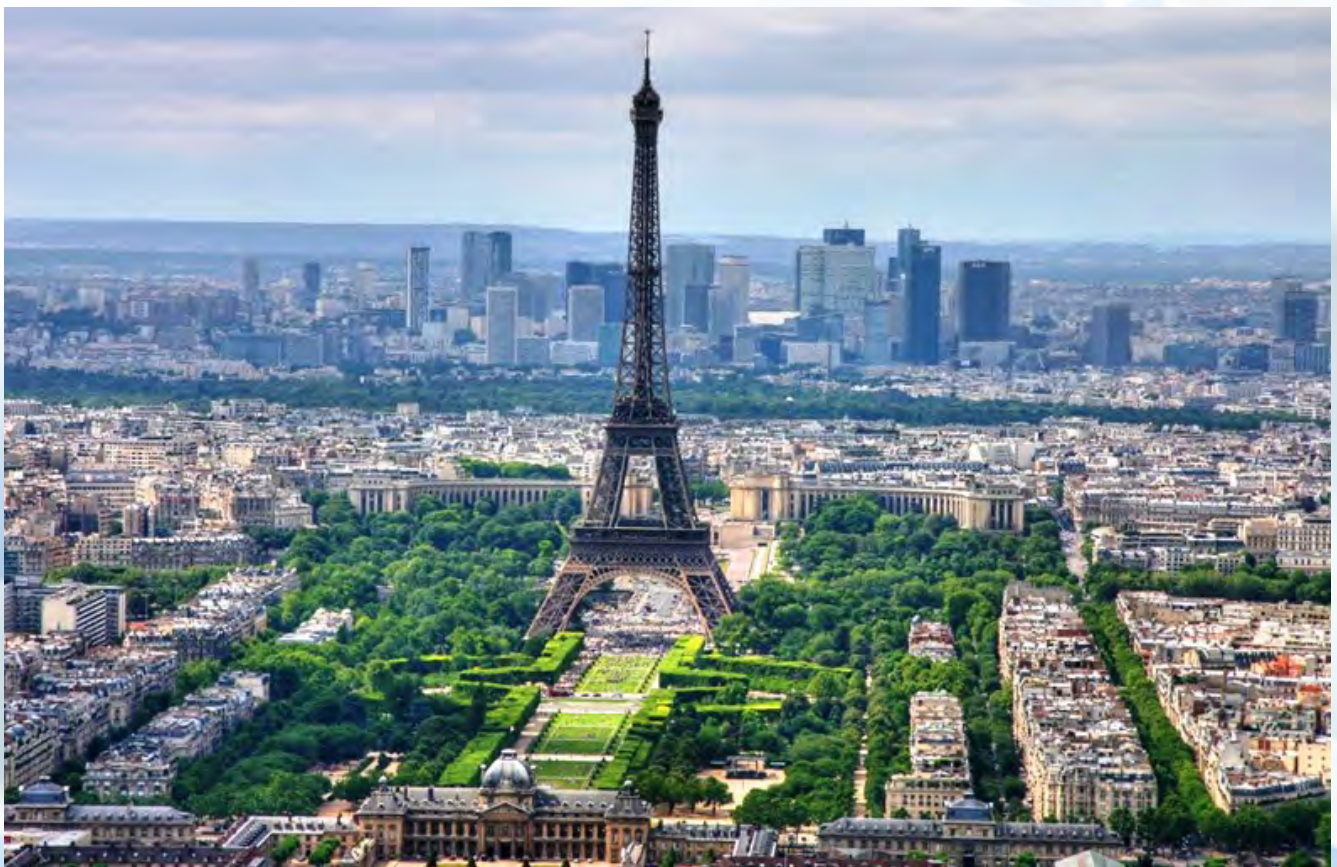
The Eiffel Tower, Paris, France